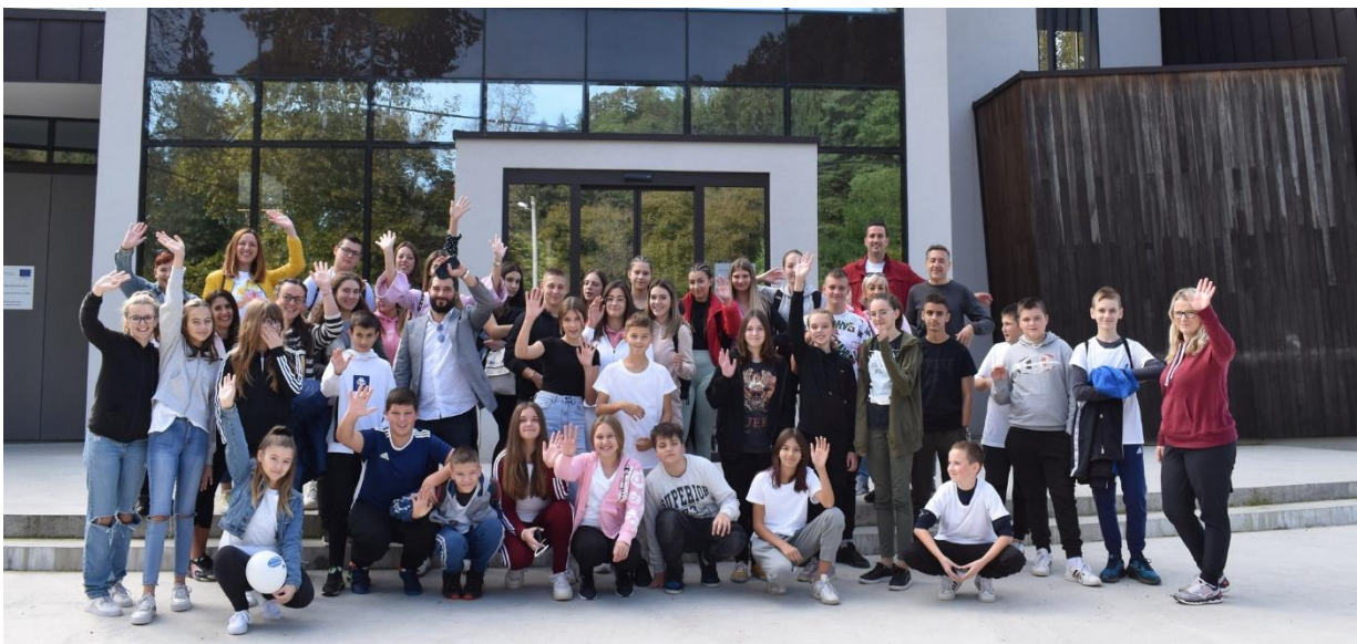
Figure 9: Celebration of EC DAY 2022 in Nature Park Papuk

On 13 th Dec 2022, the Interreg IPA Launching Conference and IPA project fair were organized in Zagreb (HR), to celebrate the approval of the new 2021-2027 Programme. More than 200 participants attended the Launching Conference on site, and more than 530 participants followed the live broadcast via our official YouTube channel.