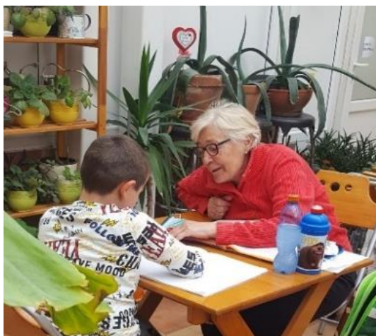
Figure 1: Beneficiaries of the integration programmes

Project partners created the social integration programme that ensures learning assistance for children and in-house care for elderly. In addition, the programme encouraged elderly to volunteer, facilitate education and exchanges between volunteers to contribute to intergenerational solidarity and tolerance in the cross-border region. During the project implementation more than 3500 users were covered by social care services or facilities whereas almost 16 tonnes of humanitarian aid and medical equipment were distributed to the vulnerable groups in the cross-border region. Total project budget was 391.478,32 EUR.