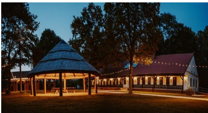
Figure 5: “Šokački stan” in Vinkovci

The partners gathered authentic food and recipes and disseminated them through two gourmet centres in Vrdnik and Vinkovci. Total value of purchased equipment for Gourmet Center in Vrdnik is more than EUR 300,000.00, while the total value of revitalization and reconstruction of “Šokački stan” in Vinkovci is about EUR 310,000.00. Project set up the Gourmet Academy program and provided thematic knowledge to stakeholders. Local producers, stakeholders and products are presented as part of the Eat Pannonia ICT platform which provides detailed information on gastronomic maps and selling spots. Total project budget was 1,410,837.22 EUR.