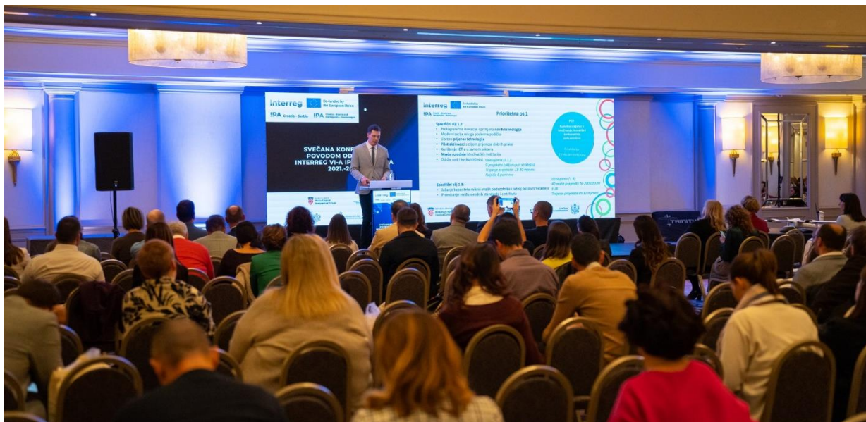
Figure 10: Interreg IPA Launching Conference in Zagreb

In the main part of the Conference, the participants were given an insight into the new possibilities for financing through the presentation of the main activities and expected results of the Interreg VI-A IPA Programmes in the new financial perspective 2021-2027. Additionally, the participants had the opportunity to visit the Interreg IPA project fair where they could see interesting exhibits and project results and talk to project partners who successfully implemented their cross-border projects in the financial perspective 2014-2020.