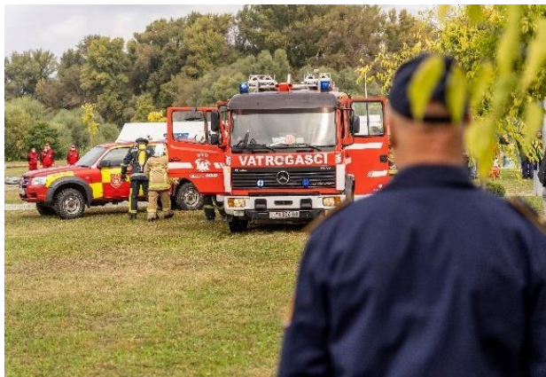
Figure 4: Exercise for public demonstration