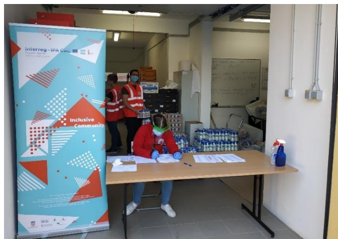
Figure 2: Registration desk during the humanitarian action