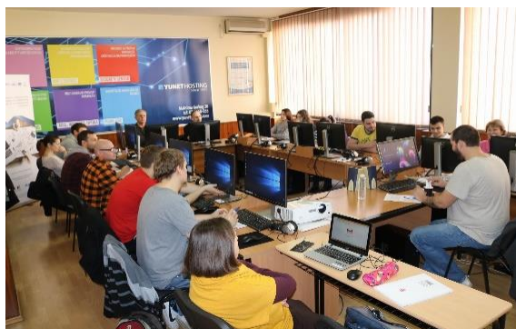
Figure 8: IT workshop