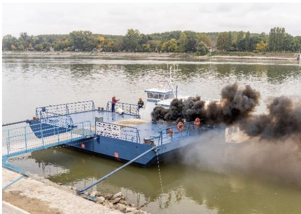
Figure 3: Demonstration of joint pilot action