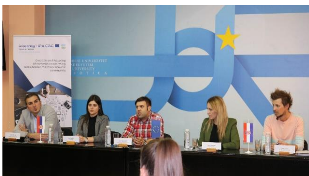
Figure 7: One of many IT conferences

Two centers for educational and entrepreneurship support in Vukovar (Croatia) and Subotica (Serbia) were established and equipped with the IT equipment worth EUR 28,000.00. One cross-border Web Knowledge Sharing Platform in a form of web service portal was launched and it currently counts more than 60 IT specialists and enables them to communicate, share knowledge, initiate projects, and cooperate.