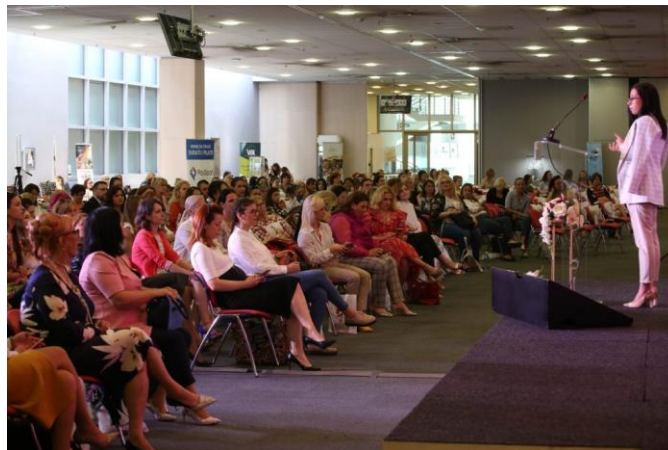
Figure 9. equipped Women Business Hub / Figure 10. WBH conference