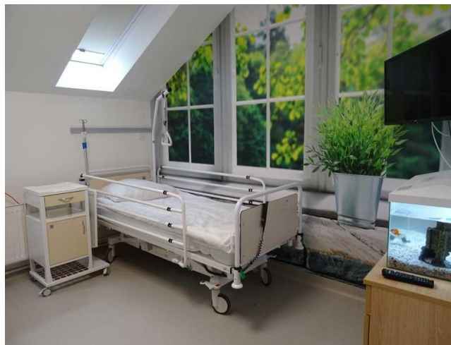
Figure 3. purchased vehicle / Figure 4. adapted room for project beneficiaries