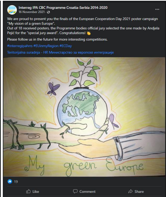
Figure 11. and 12. Facebook promotional campaigns

Two videos for projects Inclusive Community and Greenery were presented within the EC DAY campaign. Programme representative and beneficiary of the project WetlandRestore participated in the EU4Balkans debate on the topic of inclusion in Western Balkan countries where they shared experience of the programme and examples of projects dealing with social and cultural inclusion. Among 46 selected projects, project ReGerNet was part of Inclusive Growth Postcard e-book , whose aim is to show the best social impact projects.