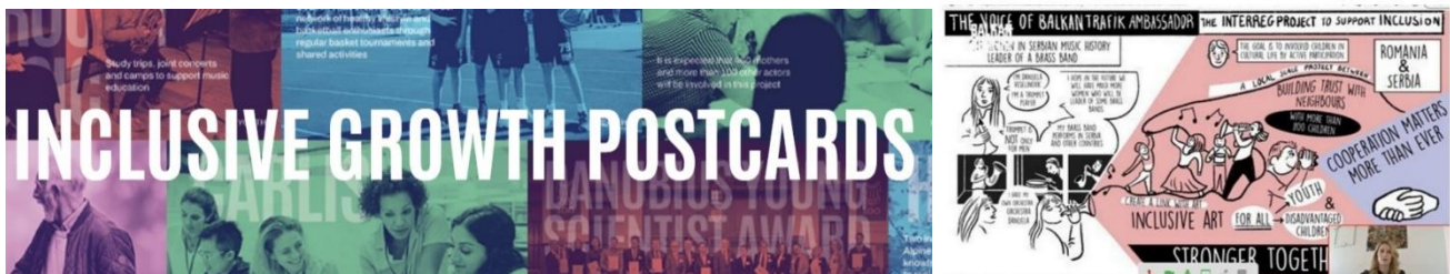
Figure 13. Inclusive Growth Postcard promotional campaign / Figure 14. EU4Balkans online presentation

Two videos for projects Inclusive Community and Greenery were presented within the EC DAY campaign. Programme representative and beneficiary of the project WetlandRestore participated in the EU4Balkans debate on the topic of inclusion in Western Balkan countries where they shared experience of the programme and examples of projects dealing with social and cultural inclusion. Among 46 selected projects, project ReGerNet was part of Inclusive Growth Postcard e-book , whose aim is to show the best social impact projects.