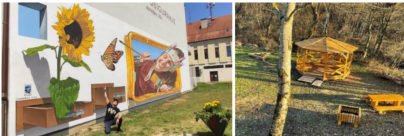
Figure 7. One of five new murals in Vukovar / Figure 8. sheltered wooden picnic area

Panona net project gathered five partners from border regions of Croatia and Serbia in a mission to diversify and integrate the tourism offer. Project partners developed tourism paths and itineraries by integrating well-being, active and cultural tourism with complementary tourism niches such as eco-tourism, cycling, hiking, wine, gastro and rural tourism. Those thematic routes connect the sites of important natural and cultural heritage in Subotica and Palić, National Park Papuk, Erdut and Vukovar. The partners organised 2 cross border tourism events, Papuk Land Art Fest (Croatia) and Land Art Fest-Tavankut (Serbia) that together with 5 new murals designed by world renowned street art artists in Vukovar became the part of integrated tourism offer serviced by the Panona Tours, joint destination management travel agency. Besides joint itineraries and events, the project also procured various thematic equipment such as info boards, sheltered wooden picnic area, solar lamps, outdoor e-totem and similar touristic equipment worth approximately 90000 EUR.