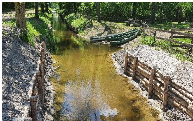
Figure 5. Special nature reserve Zasavica Lokvanj / Figure 6. habitat restoration in the pilot area of Čarna