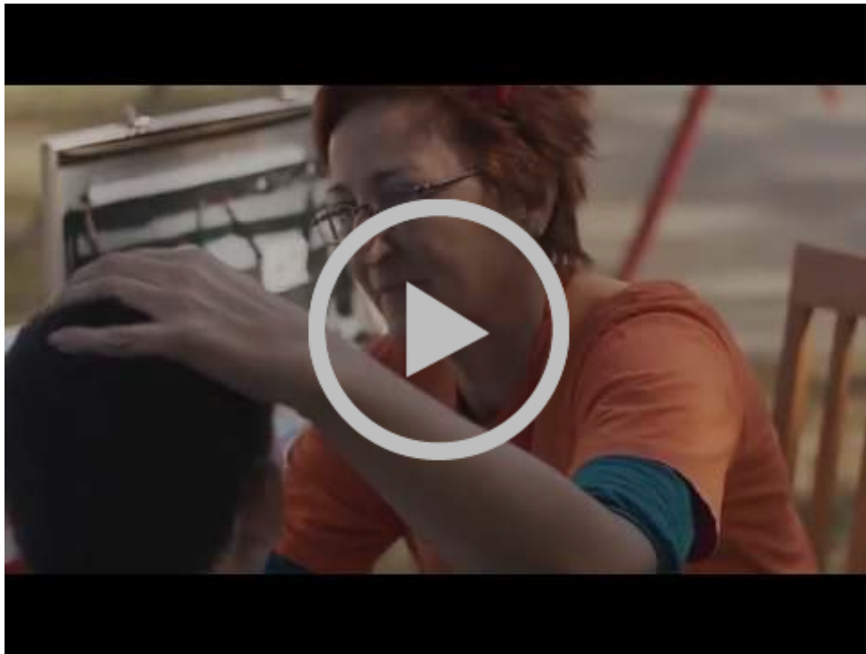
ECD 2018 Sombor

Why this kind of an event? We believe it's the best way to highlight the role of children and young people in building the Europe they want. We believe it's the best way to tell the story of cooperation between Croatia and Serbia as well.